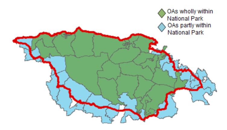
Figure 1: Output Areas within Exmoor National Park

The same approach was then used to roll forward mid-2011 estimates to produce mid-2012 estimates (and to roll forward mid-2012 estimates to produce mid-2013 estimates).