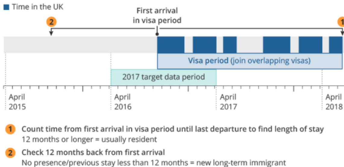
Figure 9: Illustrative example of identifying long-term international immigration using border data

Lastly, the third step is to look at any previous visa period to determine if this is a new long-term immigrant or one who has previously been in the country. If no presence is identified in the country during the 12 months preceding first arrival on a given visa, or the previous visa period had a length of stay of less than 12 months, then this pattern of travel will be considered as identifying a new long-term immigrant.