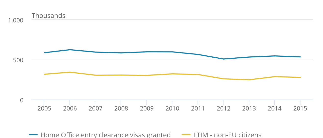
Figure 3: UK entry clearance visas granted (excluding visitor and transit visas) and Long-Term International Migration estimates of immigration to the UK for non-EU nationals, 2005 to 2015