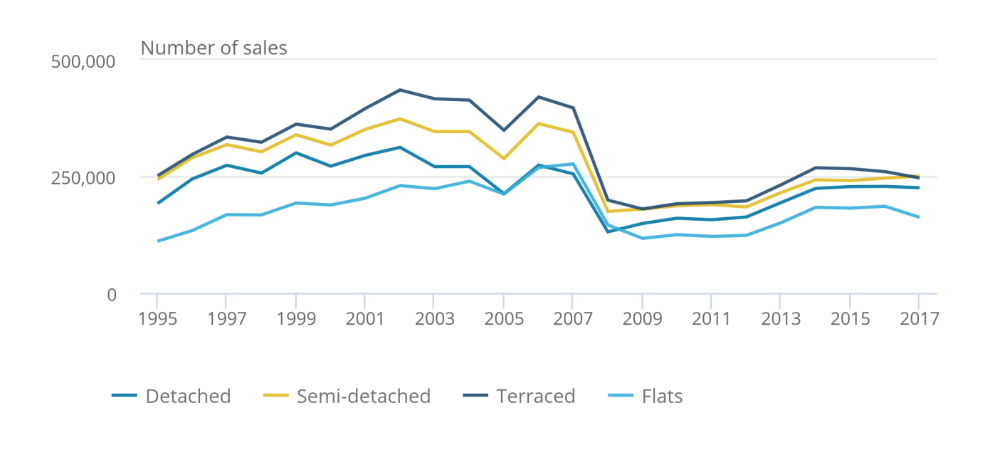
Figure 1: Number of residential property transactions by property type England and Wales, years ending December 1995 to 2017

England and Wales, years ending December 1995 to 2017