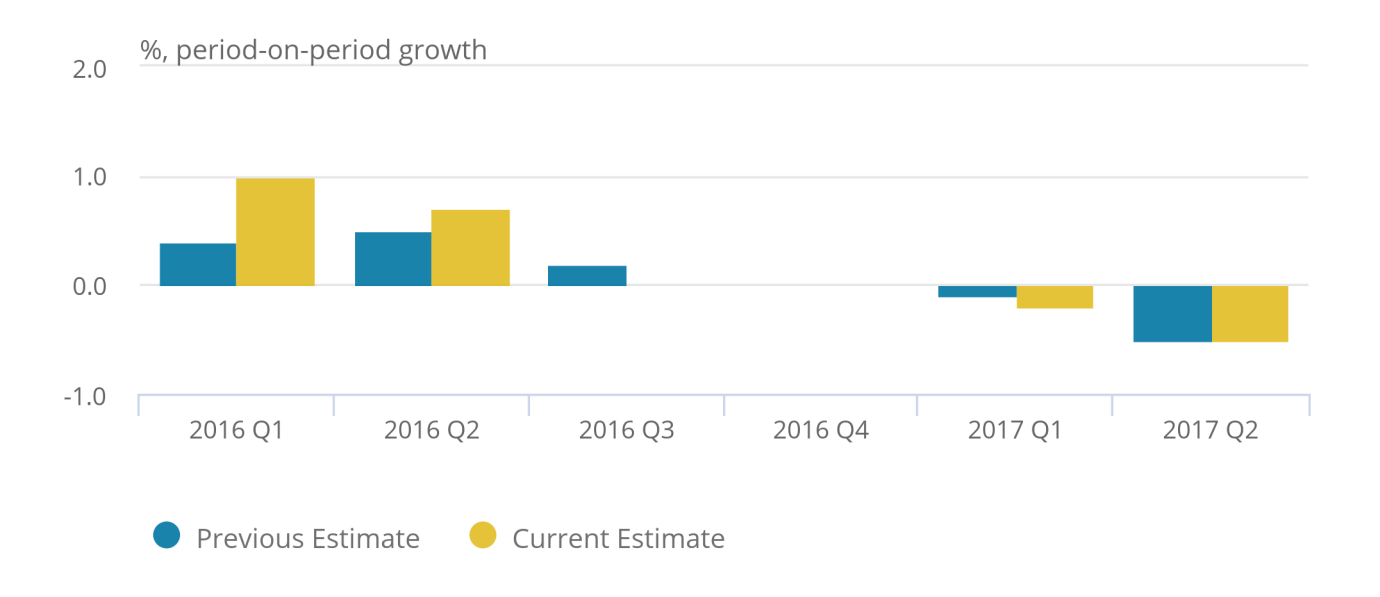
Figure 3: Previous and current estimates of period-on-period public service productivity growth rate, UK, Quarter 1 (Jan to Mar) 2016 to Quarter 2 (Apr to June) 2017