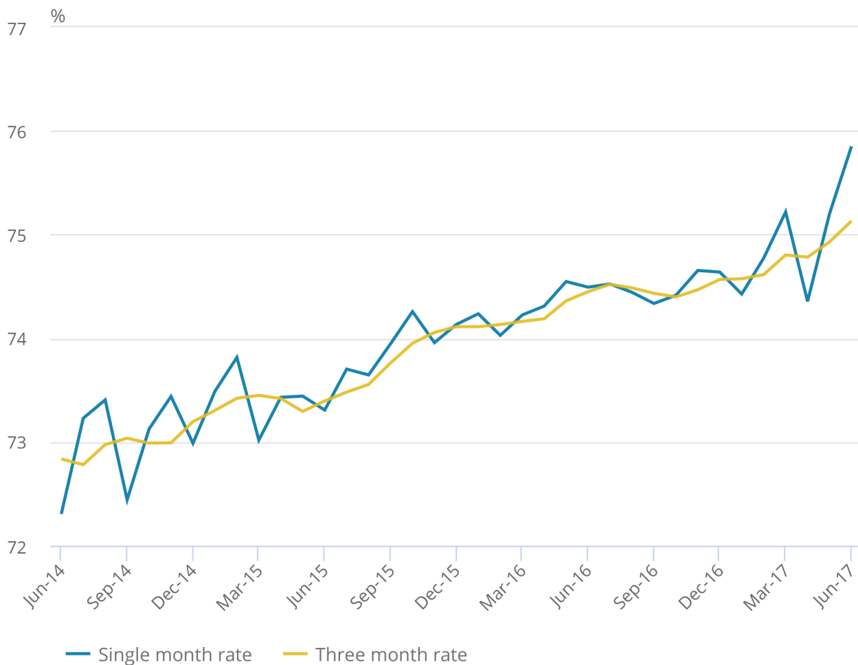
Figure 1: UK employment rates, ages 16 to 64 (seasonally adjusted), June 2014 to June 2017