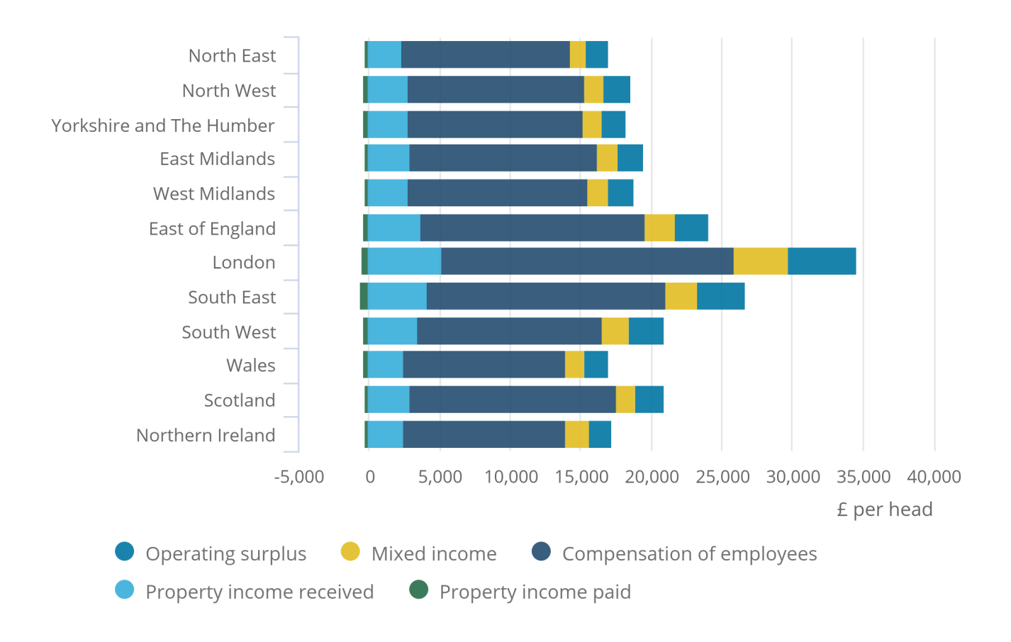
Figure 1: Components per head of the allocation of primary income account, UK, 2016<sup>1</sup> Figure 1: Components per head of the allocation of primary income account, UK, 2016^1^