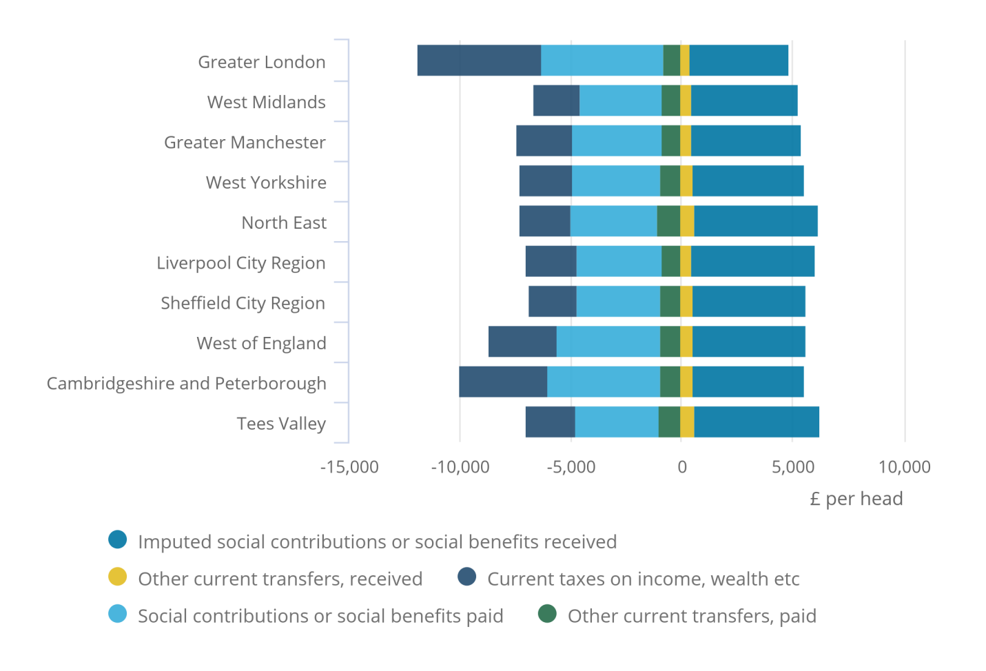
Figure 5: Components per head of the distribution of secondary income account for UK combined authorities, 2016^1^