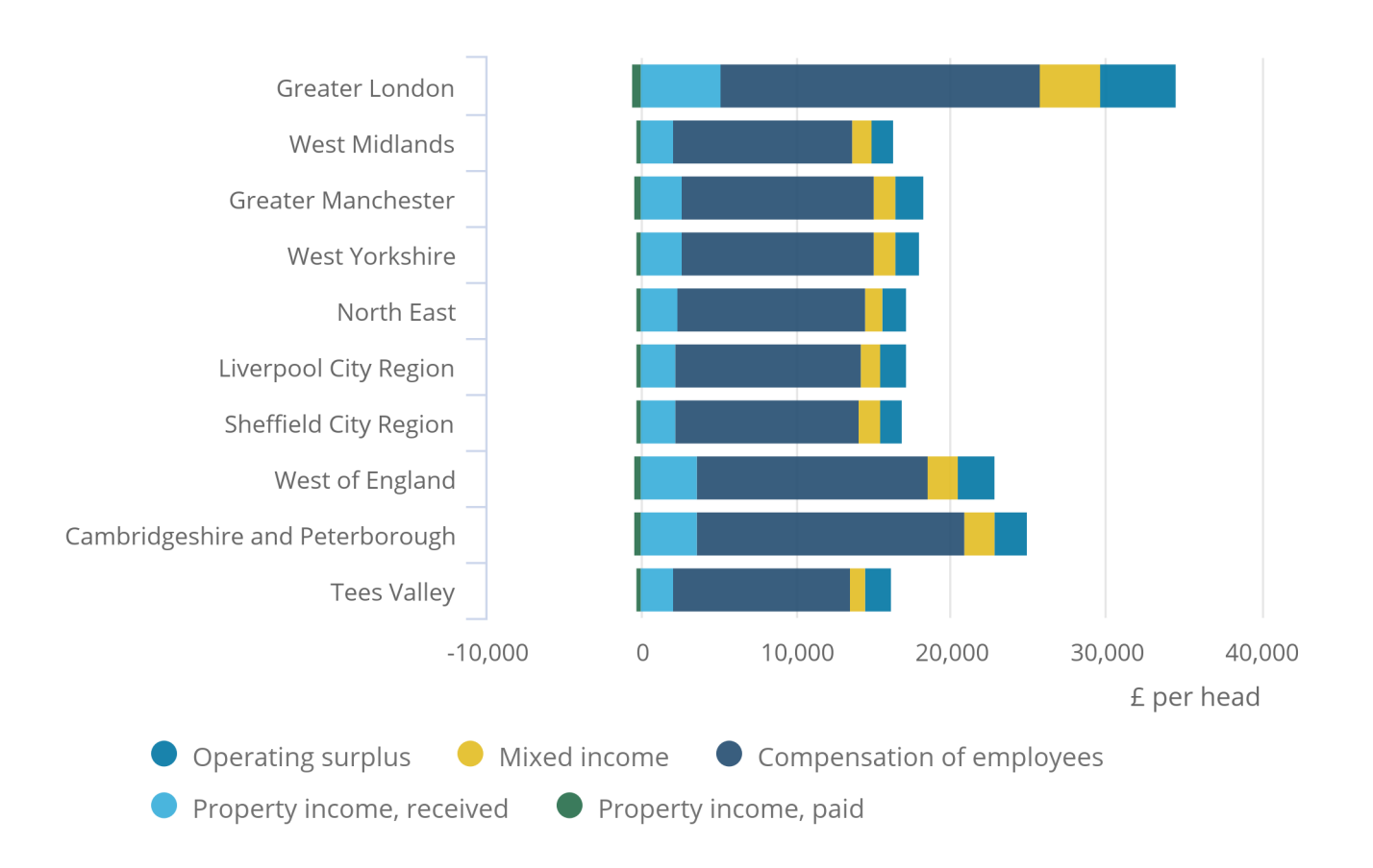
Figure 4: Components per head of the allocation of primary income account for UK combined authorities, 2016^1^