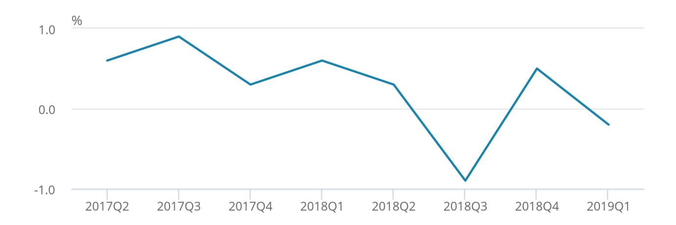
Figure 1: Quarter-on-quarter GDP growth, Quarter 2 (Apr to June) 2017 to Quarter 1 (Jan to Mar) 2019 in Yorkshire and The Humber

Source: Office for National Statistics - Regional GDP estimate