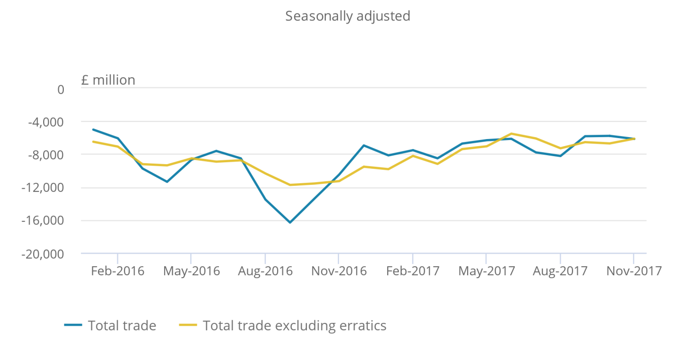
Figure 2: UK Trade deficit including and excluding erratics, January 2016 to November 2017 (on a rolling three-month on three-month basis)